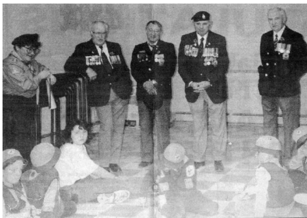
TALK ABOUT WAR Members of Royal Canadian Legion, branch 32 in Bay Roberts explained the horrors of war to a local Beaver group last Tues-