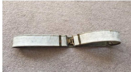
Dad's Web Belt with his writings inside