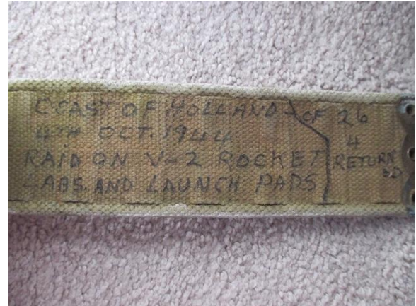
"Coast of Holland - of 26 4 returned" "4th Oct 1944" "Raid on V-2 Rocket Labs and Launch Pads"