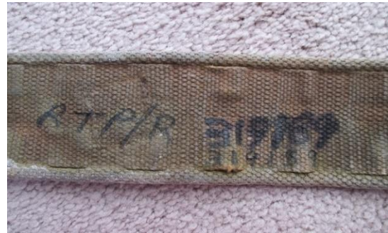
Service Number "RTP/R 319189"