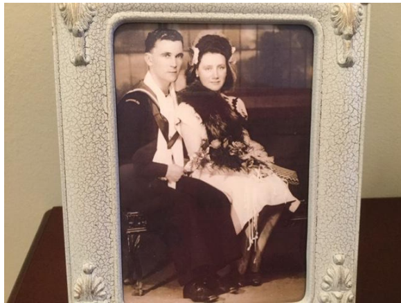
Mom & Dad's Wedding Day (Nov 14 th 1945)