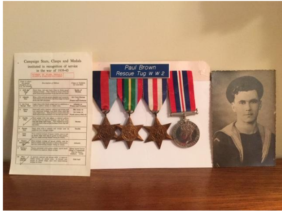
Dad's Medals with description (left) of each