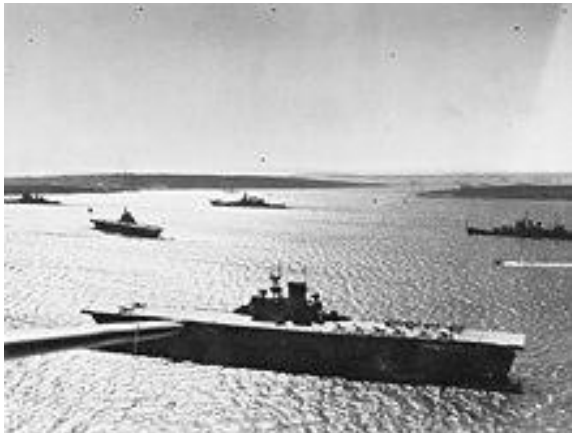
Scapa Flow in April 1942